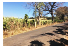
Frente de propiedad