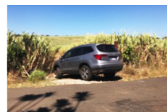
Entrada principal a la finca